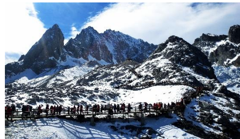
Jade Dragon Snow Mountain

After breakfast, early morning drive to Jade Dragon Snow Mountain , considered the holiest mountain for the local Naxi people. There are 13 undulating peaks being covered with snow and glacier ice all year round. The mountain is said to look like a quiet beautiful girl wearing a pure white wedding gown. Enjoy a full view of the mountain while strolling the meadow of Ganhaizi and capture the best scene of the snow mountain at the hillside Spruce Plateau which is an alpine meadow embraced by lush spruce forests.