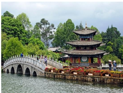
Black Dragon Pool

Enjoy breakfast in the comfort of your hotel, check-out, airport transfer, depart Kunming (KMG) ZH9591 1245hrs, arrive Lijiang (LJG) 1350hrs (approx. flying time 01hr 05mins), meet and greet. You will be escorted to Black Dragon Pool to view the amazing azure sky reflected in the water, a great photo stop with the Jade Dragon Snow Mountain in the background.