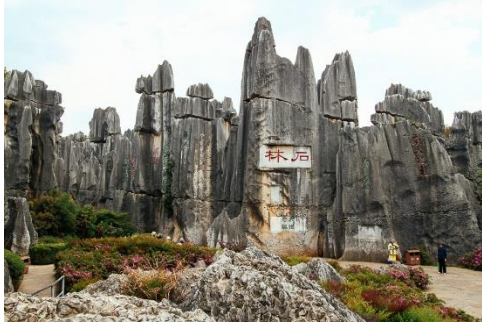
Big Stone Forest

Depart Hong Kong (HKG) KA760 1125hrs, arrive Kunming (KMG) 1405hrs (approx. flying time 02hrs 40mins), meet and greet followed by your private tour which will cover Shilin National Scenic Area , which includes Big Stone Forest, Naigu Stone Forest, Long Lake, Moon Lake and Qifeng Cave . Lunch served at a local restaurant.