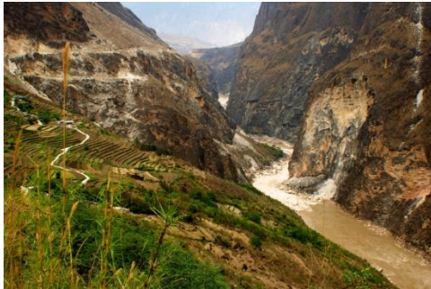
Tiger Leaping Gorge

You will get up early and enjoy breakfast, check out hotel and you will driven to Shangri-La county, on the way visit Tiger Leaping Gorge . Jinsha River flows into the narrow valley with a stone in the center, an ancient saying is that the gorge is so narrow that a tiger was able to leap over to the other side of the river, hence the name.